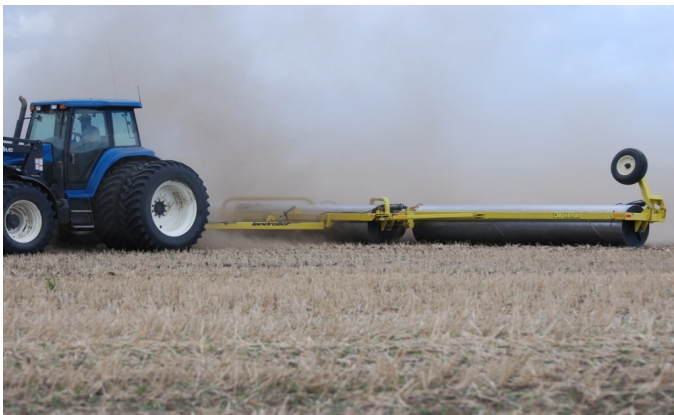
Figure 1. In-field rolling operation.

Be aware that if seedlings are just below the soil surface but not yet emerged, they may be more susceptible to mechanical or crushing damage from rolling.