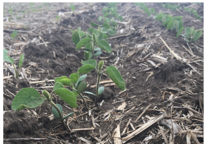
Figure 6. Soybeans at the unifoliate (VC) stage with the trifoliate leaf just emerging. The trifoliate leaf should be fully expanded prior to rolling.