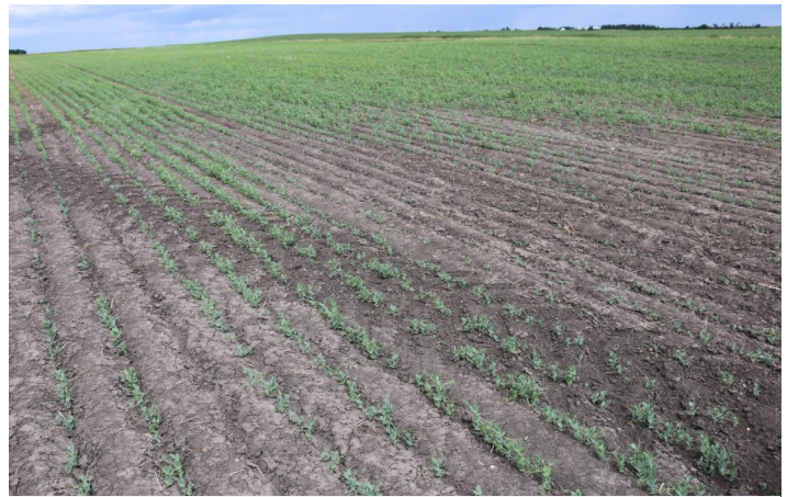
Figure 2. Pea field with an area of increased root disease in an area that was likely too wet during rolling, resulting in compaction.

Rolling a crop after it has emerged will add additional stress to the crop. Wait at least 48 hours, preferably upwards of three to four days, before rolling to allow the crop to recover from a stress such as a herbicide application, frost, or drought.