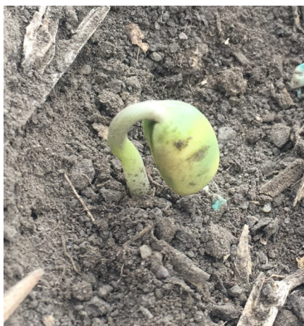
Figure 4. Emerging soybean illustrating the hypocotyl arch stage.